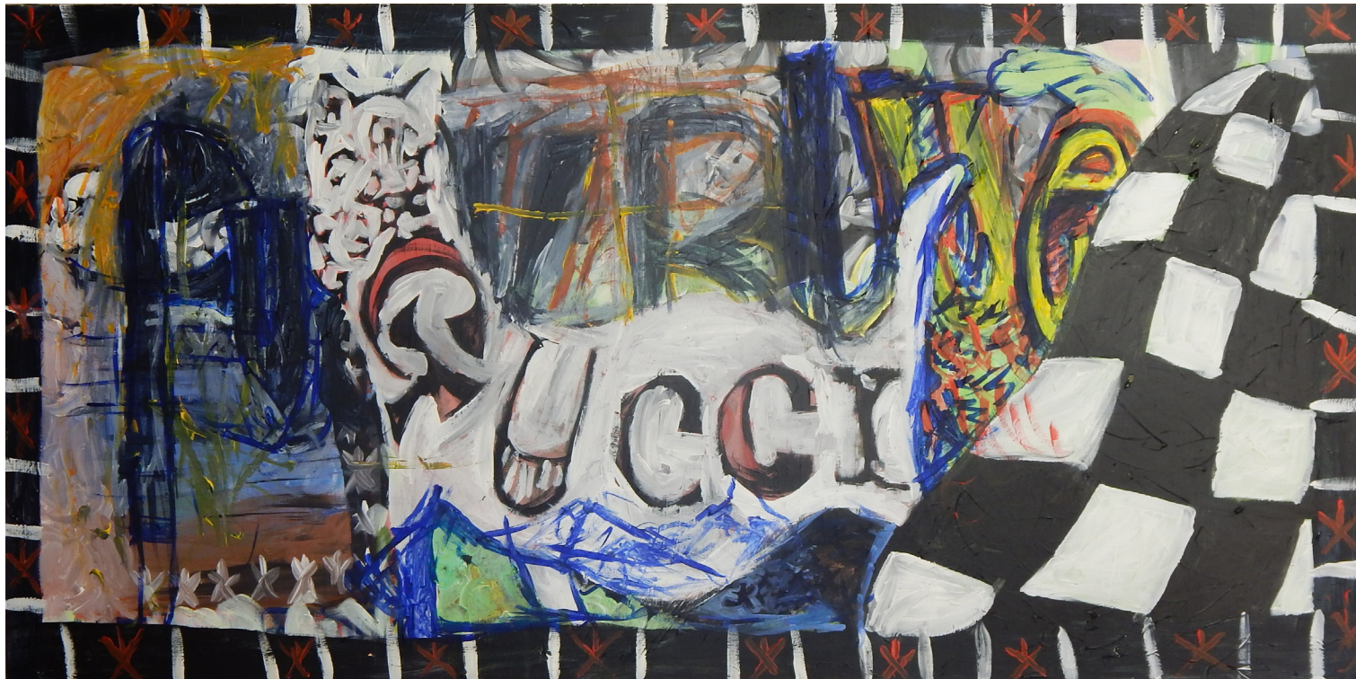
GUCCI CAT/ fuck you BLUE!