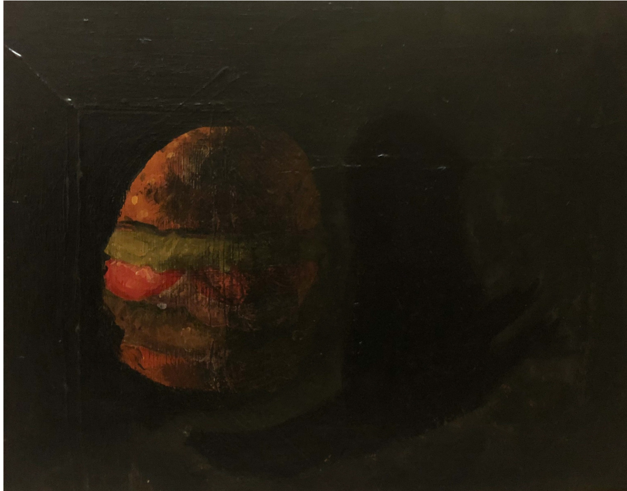
Burger and dinosaur in DARK room 2018 Acrylic on Canvas Board 36cm x 46cm £300