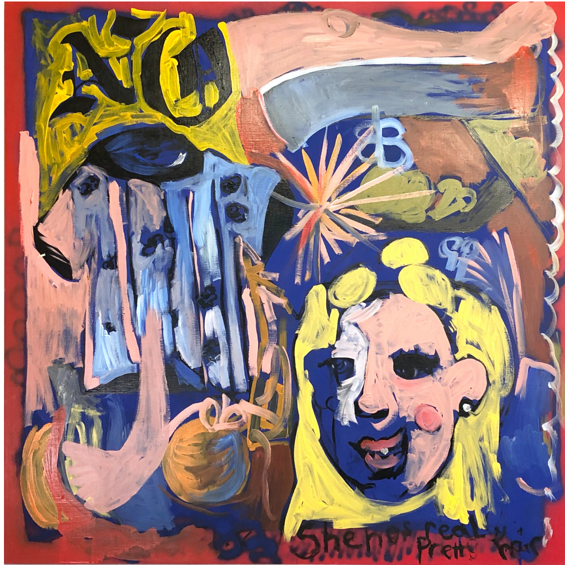
No bad days// All bad days 2018 Acrylic and Acrylic Spray Paint on Wood 91cm x 91cm £1,200