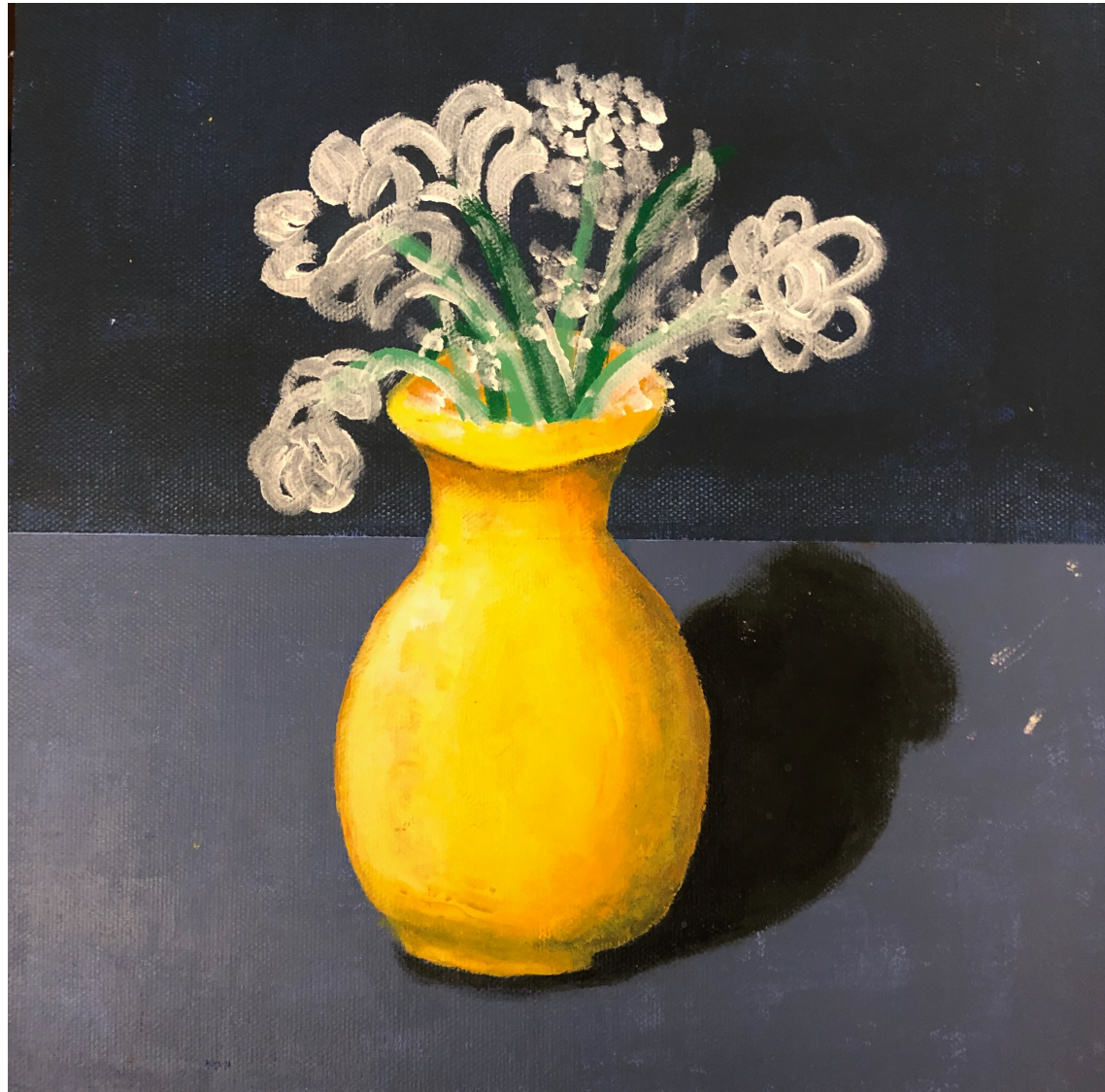
'BLUE room' 2018 Acrylic on Canvas Board 25cm x 25cm £300