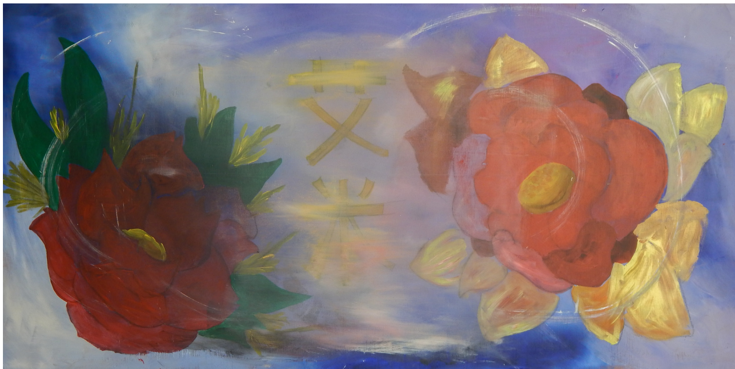
AMY (sorry, I will always love you)