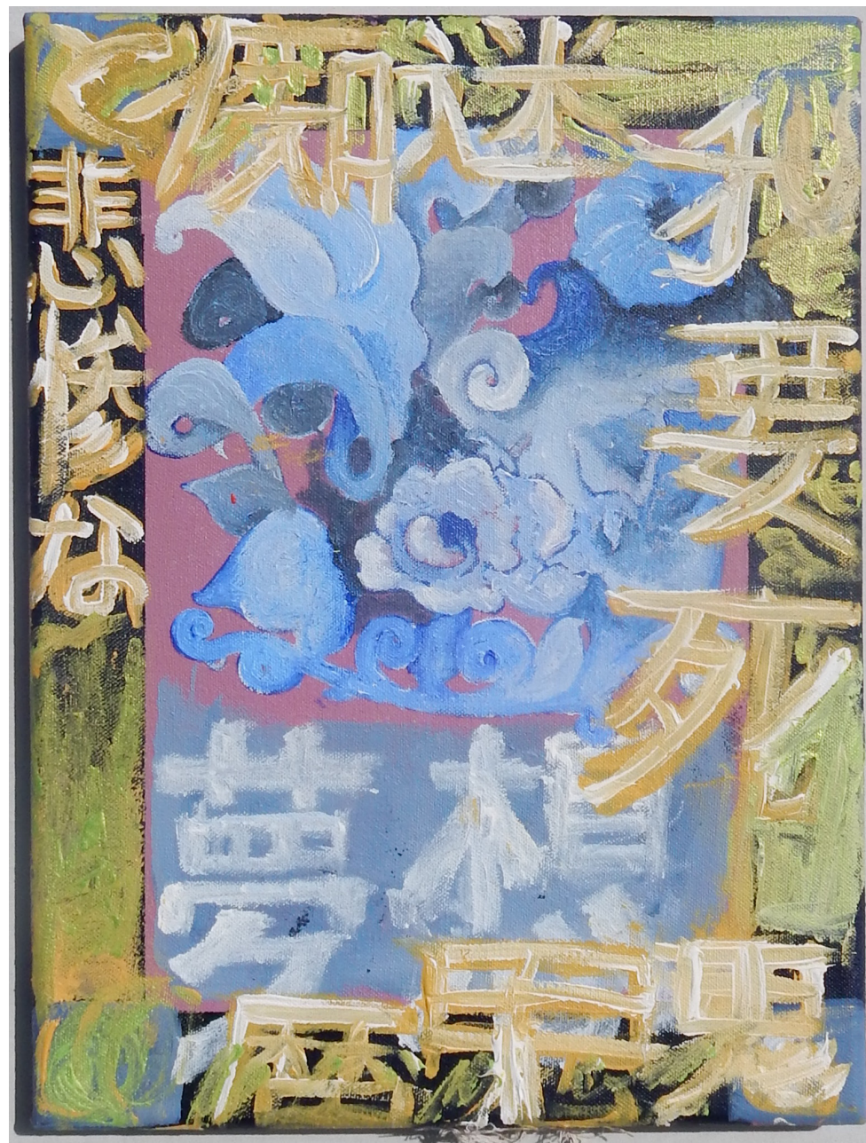
I'm not sure about anything/ I'm a fucking mess, I don't know what to do. 2018 Acrylic, Acrylic Spray Paint and Emulsion on Canvas 41cm x 30cm £450