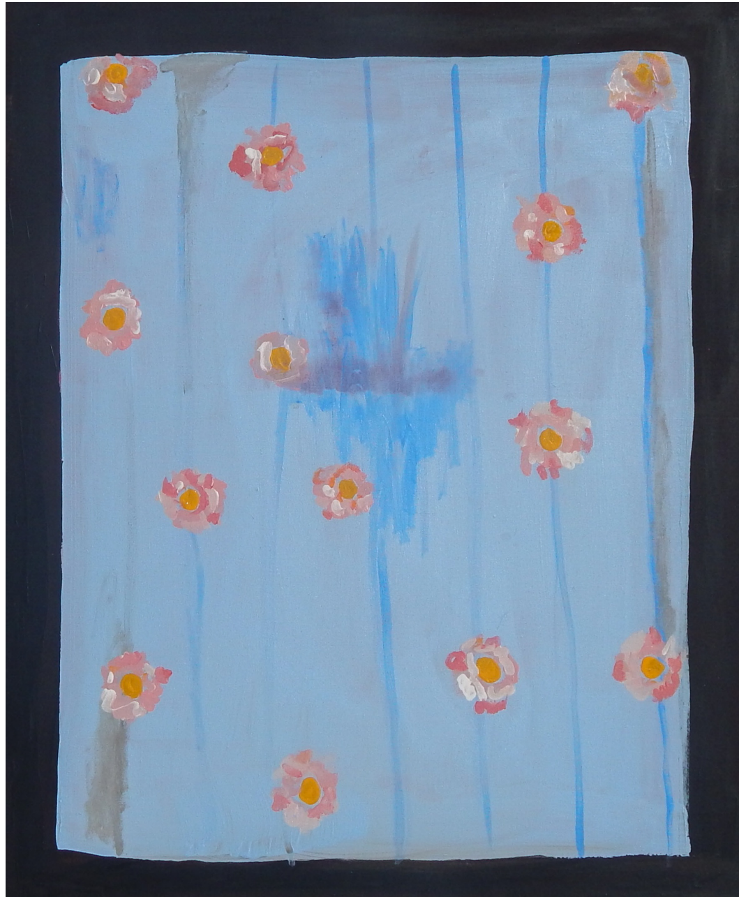
BLUE blouse 2018 Acrylic and Emulsion on Red Polyester 48cm x 40cm £350