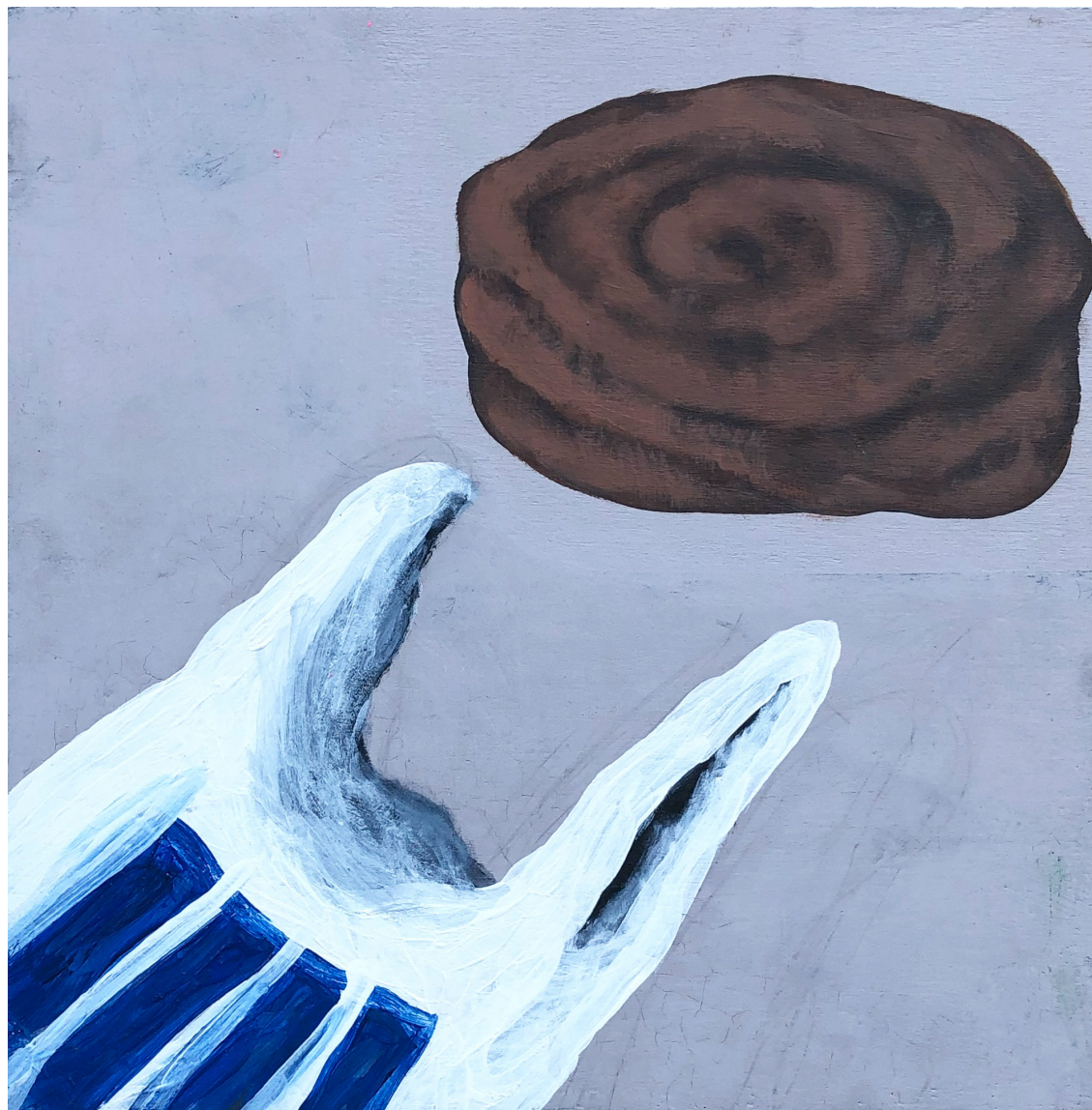
Carrier bag and cinnamon roll 2018 Acrylic and Emulsion on Wood 25cm x 25cm £400