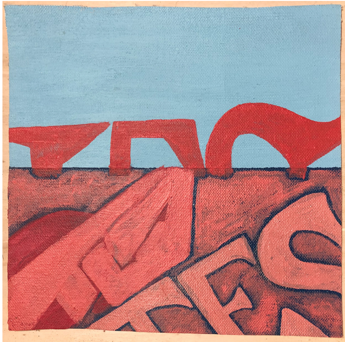
Phillip Guston/Tesco/ Surrealist Landscape 2018 Acrylic and Oil on Canvas 20cm x 20cm £200