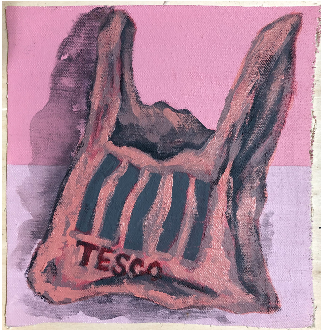
OMG that bag's SO gay 2018 Acrylic and Oil on Canvas 20cm x 20cm £200