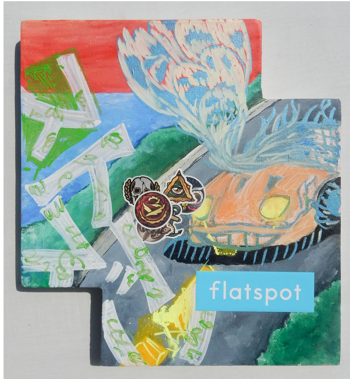
Haunted Ferrari SEGA MEGADRIVE 2018 Acrylic, Acrylic Pen and Stickers on Canvas 48cm x 53cm £1,000