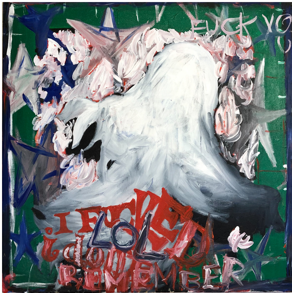
GHOST girl/ HA I DON'T REMEMBER IF WE FUCKED 2018 Acrylic on Canvas 80cm x 80cm £1,100