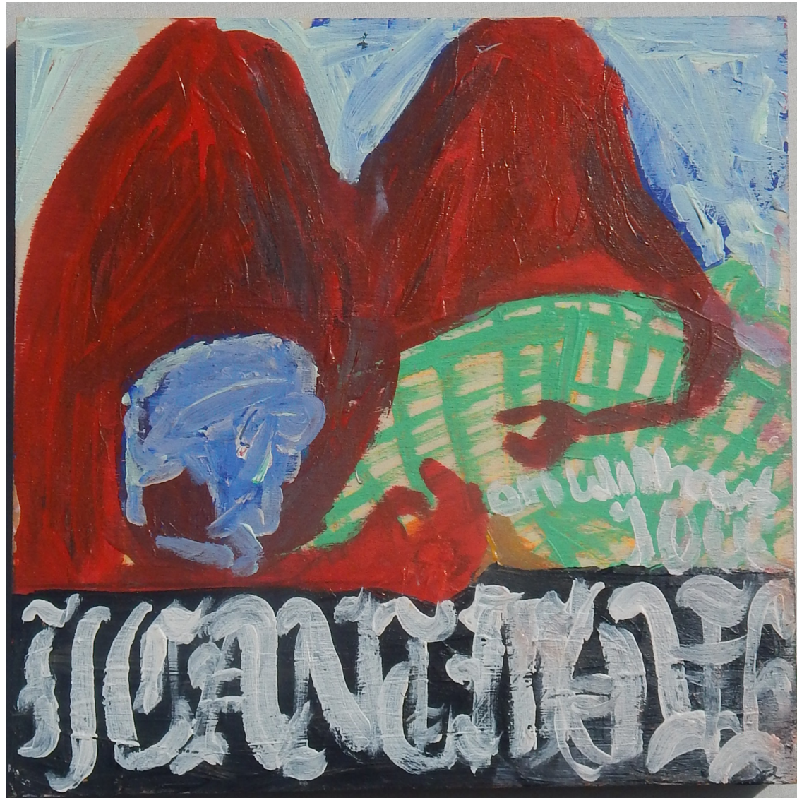
I can't move on without you 2018 Acrylic on wood 20cm x 20cm £300