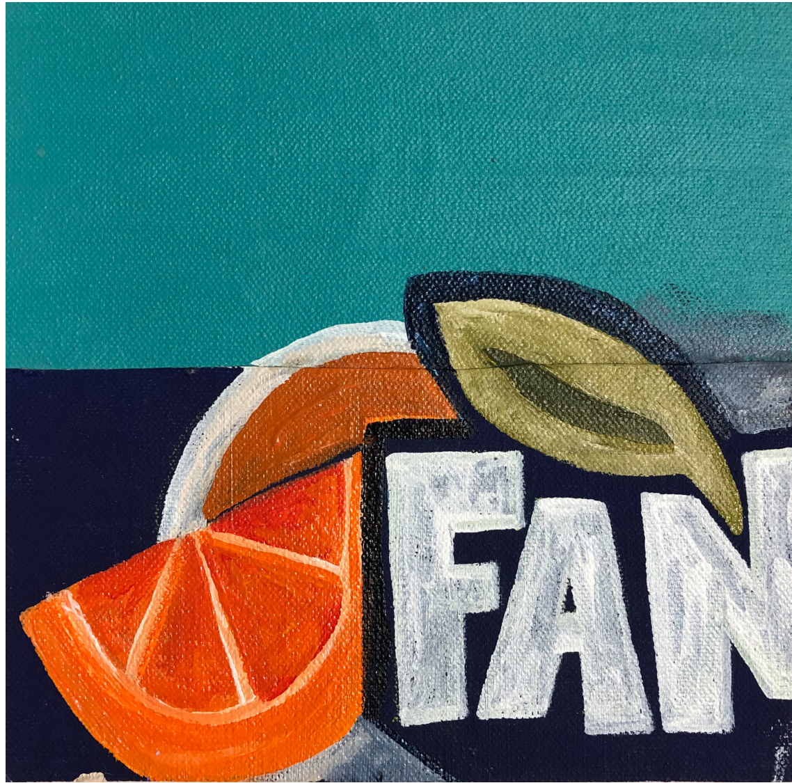
Fanta 2018 Acrylic and Oil on Canvas 20cm x 20cm £200