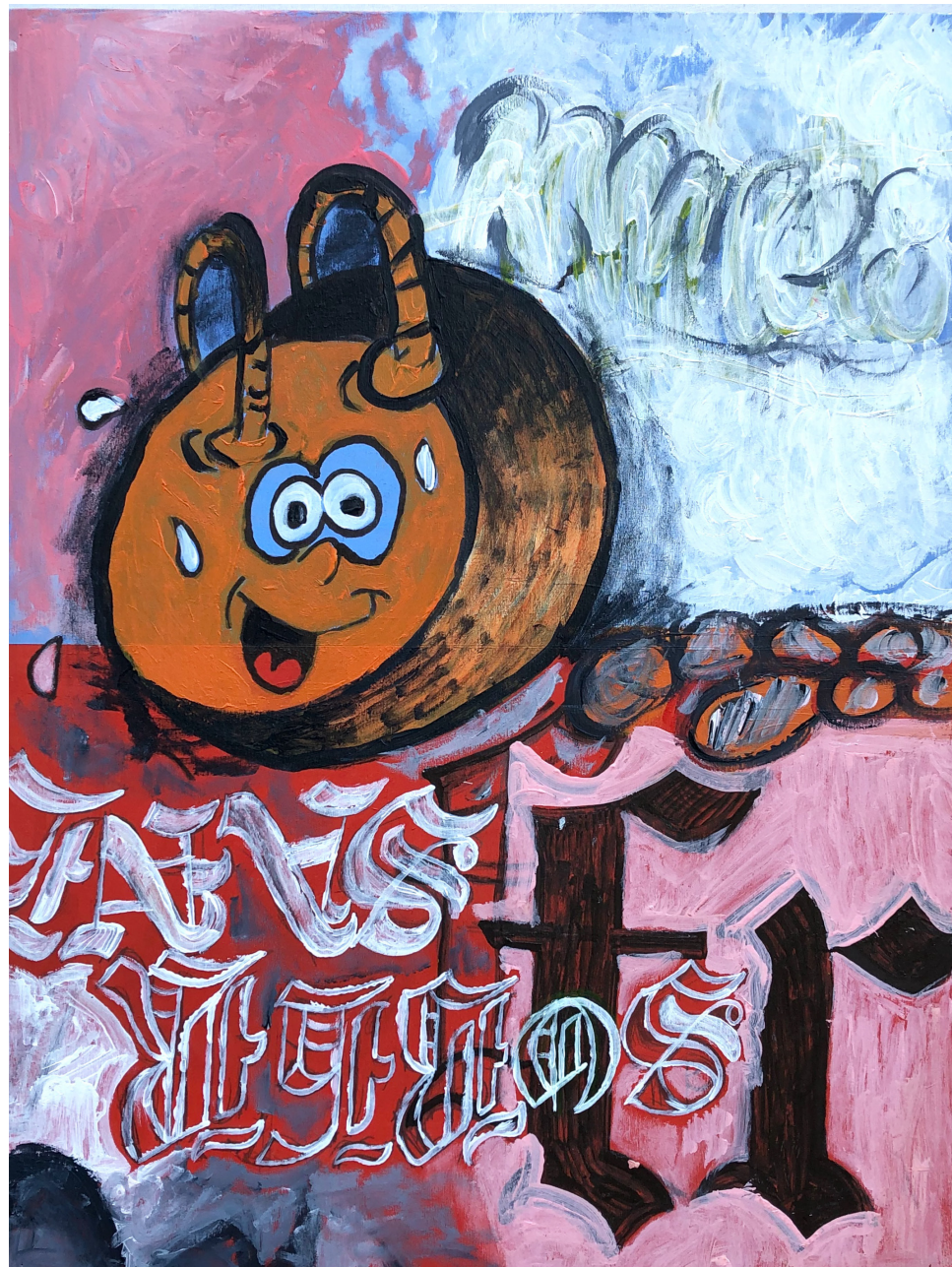
Moonehoper/ fr/ sorry/ Amphetamine[r] Dream[er] 2018 Acrylic on Wood 30cm x 41cm £750