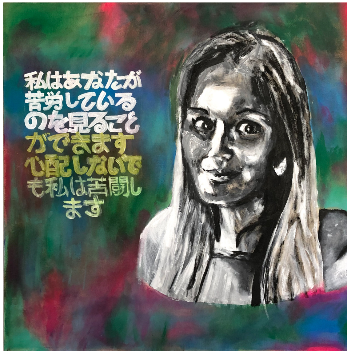
Somethin' else (at least I thought)